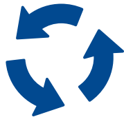
Existing or CrawfordTech's Work owTools