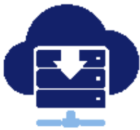
CrawfordTech's SunRise App Server