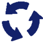
Existing or CrawfordTech's WorkflowTools

The PRO Designer GUI makes configuring Operations Express easy