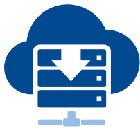
CrawfordTech's SunRise App Server